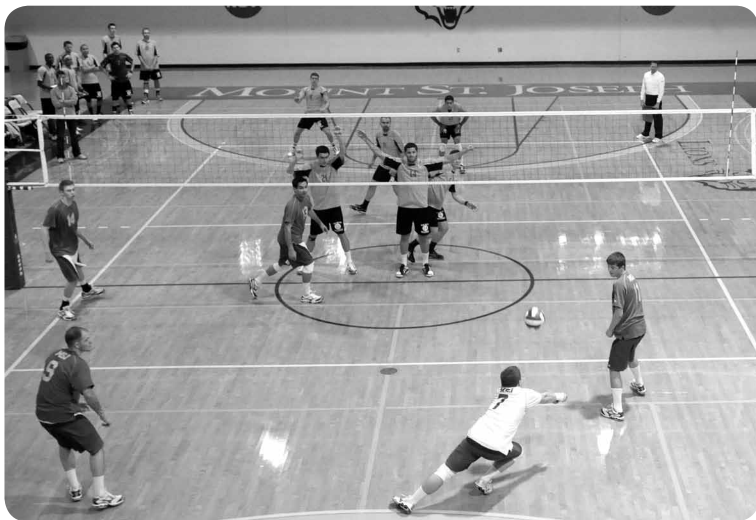
The Lions on defense in 2011 home match action.

"The CVC is split up into an East and West Division and will be one of the better conferences in the country bringing together numerous teams that were nationally-ranked last season," states Bennett.