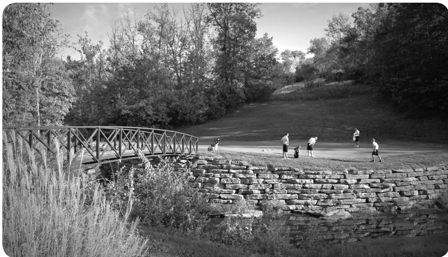
The Lions in fall 2010 play on their home course at Aston Oaks Golf Course.