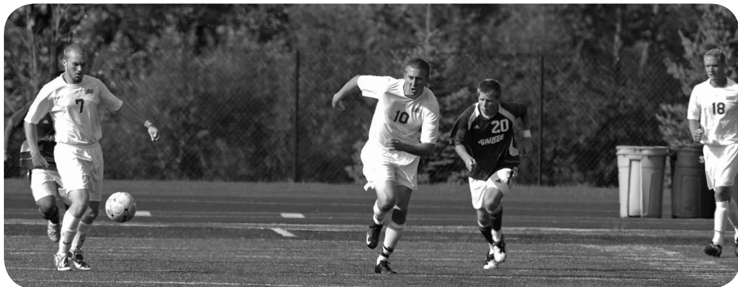
The Mount offense in a 2009 game versus Thomas More College.

Bold indicates returning (current) player.