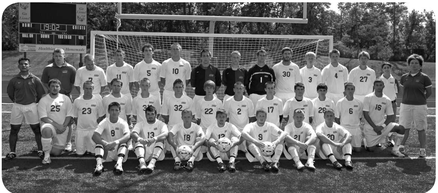
The 2009 College of Mount St. Joseph soccer team