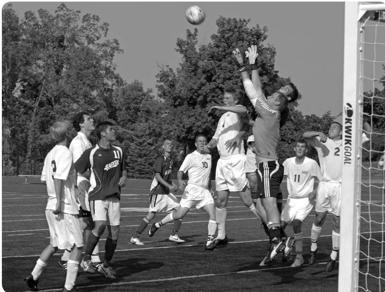
The Mount offense applies pressure in a 2009 game.