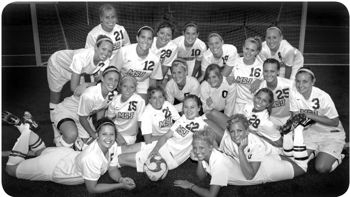
2008 HCAC Regular Season and Tournament Champions!