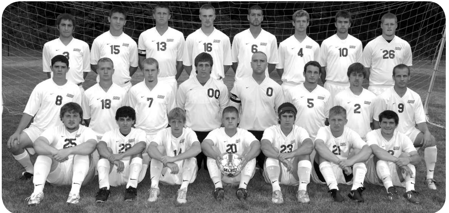
Mount 2008 Team