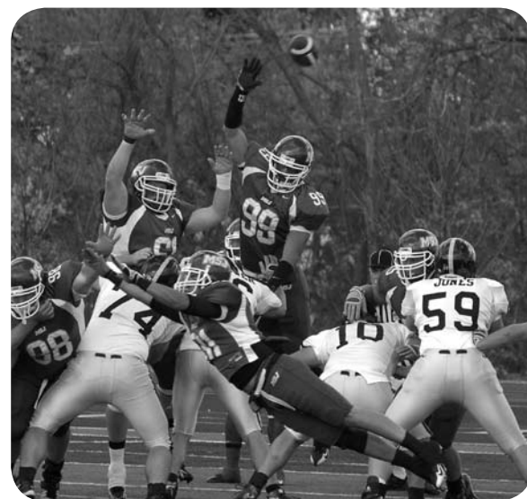
The 2008 Lions' special teams attempt to block a kick.