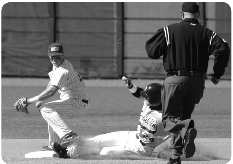
The Lions in 2009 action versus Franklin College.

HCAC Win-Loss record does not include HCAC Tournament results.