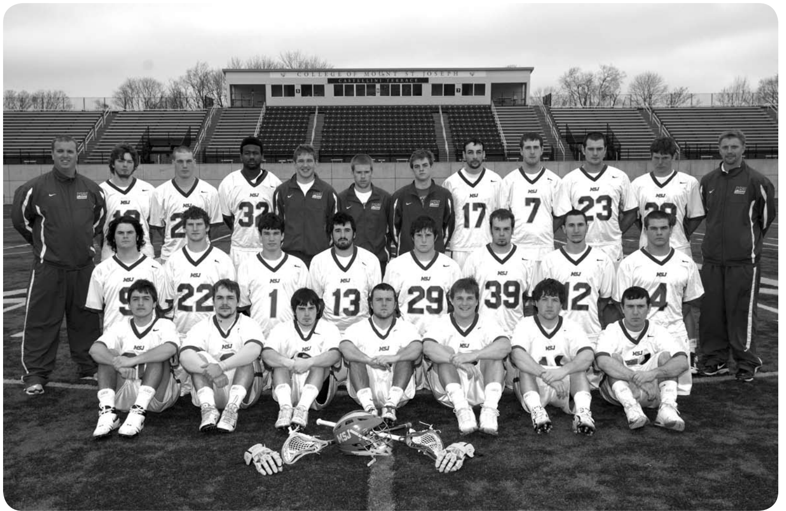
2009 Mount Men's Lacrosse Team