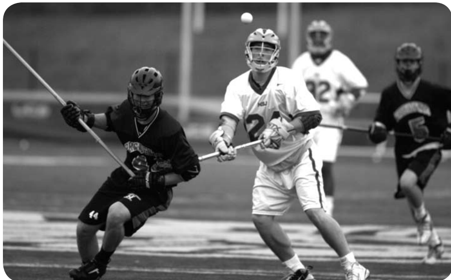
The Mount won a program-best six games in 2009.