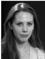
Ally Auditore Sports Information Co-op