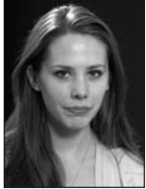
Ally Auditore Sports Information Co-op